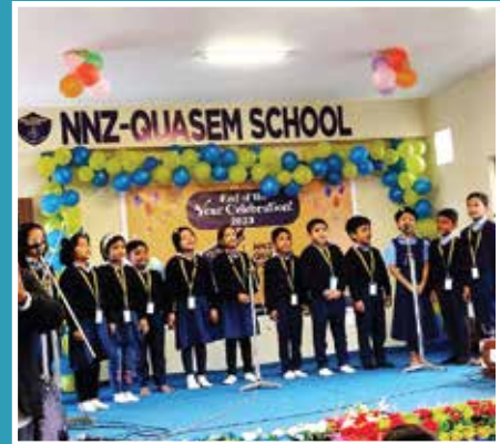
Music performance presenting by students on "End of the Year Celebration"

The "End of the Year Celebration" held on December 9, 2023, at NNZ-Quasem School, highlighted students' efforts and achievements throughout the year. The day-long event featured mesmerizing performances of music, dance, and poetry by students.