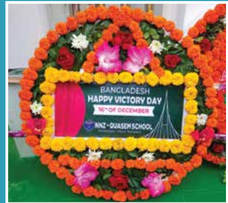
Victory Day Celebration at NNZ-Quasem School

On Great Victory Day, 16 December 2023, NNZ-Quasem School paid heartfelt tribute to the martyrs by laying wreaths with respect and reverence. The day also featured a drawing competition held in a joyful atmosphere, where students showcased their creativity. Prizes were awarded to the winners, adding to the spirit of the celebration.