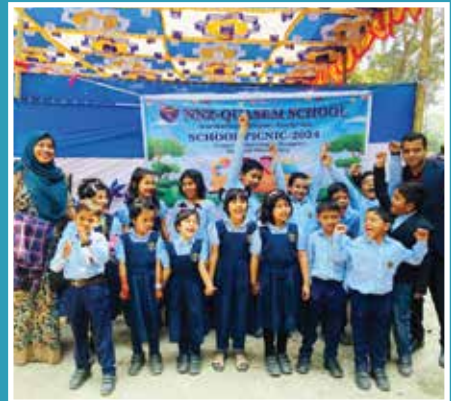
Students of NNZ-Quasem School in their Annual Picnic

On March 8th, 2024 NNZ-Quasem School's annual picnic wrapped up in high spirits at Vinnya Jagat Amusement Park in Rangpur. The event was a delightful gathering where students, parents, teachers, and all members of the school community came together to celebrate and enjoy a day full of joy and excitement.