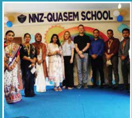
Honourable guests with our wonderful teachers at NNZ-Quasem School