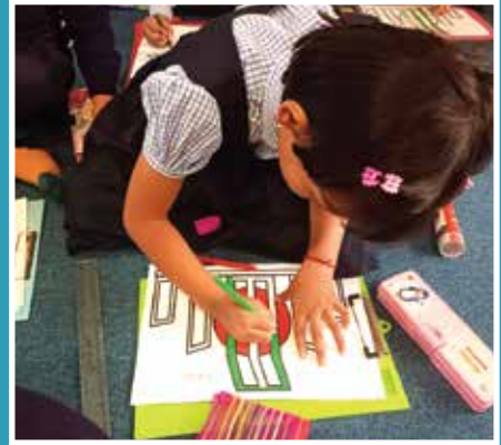
Art competition on the occasion of International Mother Language Day

On International Mother Language Day, 23 February 2024, NNZ-Quasem School honored the martyrs by placing floral tributes at the local Shahid Minar. The school then hosted a drawing and recitation competition on its premises, celebrating the occasion through creative expression. Prizes were awarded to the winners, providing a meaningful and engaging tribute to the significance of the day.