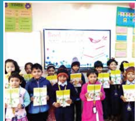
Book Festival NNZ-Quasem School